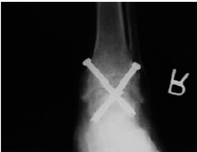
FIGURE 8 Anterior-posterior ankle weightbearing x-ray, 6 months post operative film.