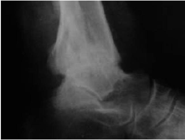
FIGURE 11 Lateral ankle weightbearing x-ray, 36 months post operative film.