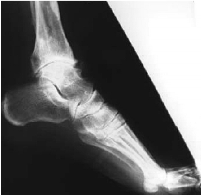
FIGURE 2 Typical pre-operative ankle lateral weightbearing x-ray.

position ( \leq 5^\circ of dorsiflexion), neutral to 5^\circ of valgus, external rotation of 0^\circ to 15^\circ , neutral or slight posterior translation of the talus on the tibia, and a limb-length discrepancy of \leq 1.5 cm due to shortening of the operated lower extremity. The clinical outcome was considered to be good when there was solid union without infection; slight equinus ( \leq 5^\circ of plantar flexion), 5^\circ to 10^\circ of valgus or varus, \leq 5^\circ of internal rotation, or \leq 1 cm of anterior translation; and a limb-length discrepancy of \leq 3 cm. The clinical outcome was considered to be fair when there was union without infection; 5^\circ to 10^\circ of plantarflexion or dorsiflexion, 5^\circ to 10^\circ varus or >10^\circ of valgus, internal rotation of the foot > 5^\circ , anterior translation of >1 cm, or moderate forefoot deformity; and limb-length discrepancy of >3 cm. If the nonunion, infection, or malunion remained equal to or worse than the preoperative condition, the clinical outcome was considered to be poor.