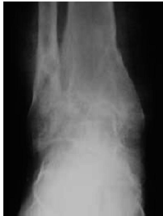
FIGURE 10 Anterior-posterior ankle weightbearing x-ray, 36 months post operative film.

the AOFAS rating scale (Student t -test) demonstrated a significant ( P < .001 ) difference between the mean preoperative score of 38 points (range, 33–45) and the mean postoperative score of 72 points (range, 65–78). Six patients demonstrated an excellent functional result, 2 had a good result, and 1 patient exhibited a fair result. Seven patients demonstrated an excellent clinical outcome and 2 had a good clinical outcome. At the time of final follow-up, all 9 patients presented wearing regular shoes and 6 wore shoes with an ankle-foot orthosis. All