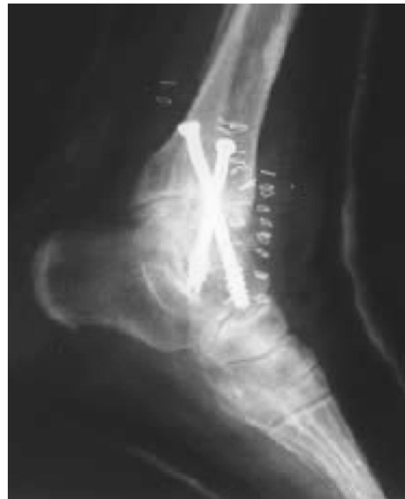
FIGURE 6 Lateral weightbearing ankle x-ray, immediate post operative film.