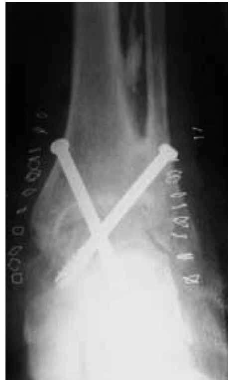
FIGURE 5 Anterior-posterior weightbearing ankle x-ray, immediate post operative film.

This study included 9 patients, 6 women and 3 men, displaying a mean average age of 50 years (range, 43–57 years). The patients were followed up for a mean average of 55 months postoperatively (range, 17–71 months). The mean duration of symptoms preoperatively was 5 years (range, 4–5 years). All 9 of the patients achieved a solid arthrodesis, and they all stated that they were satisfied with the outcome of the surgery and would undergo it again. Seven patients related no pain in the postoperative period after identification of radiographic evidence of solid fusion, whereas 2 patients reported occasional, mild pain that necessitated the use of analgesics. Analysis of