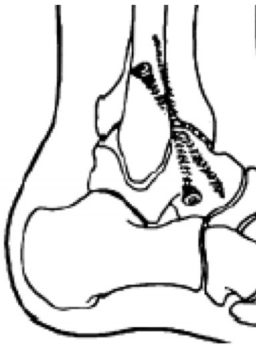
FIGURE 4 Illustration, lateral view of ankle anterior-posterior weightbearing x-ray with two crossed fixation compression screws.

clinical and radiographic progress, the patients returned to normal shoe gear with use of a custom solid ankle-foot orthosis for approximately 3 months.