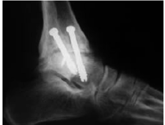
FIGURE 9 Lateral ankle weightbearing x-ray, 3 months post operative film.