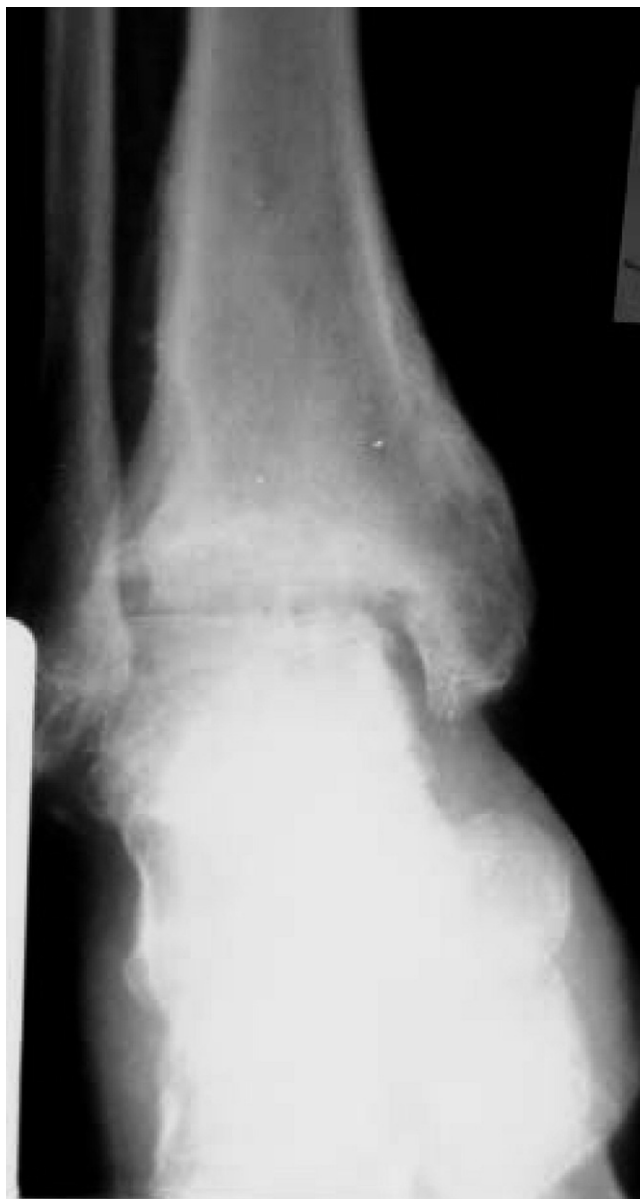
FIGURE 1 Typical pre-operative ankle anterior-posterior weight-bearing x-ray.

The surgical outcome was assessed with the numeric American Orthopaedic Foot and Ankle Society's (AOFAS) Ankle-Hindfoot rating system. The AOFAS scale is a numerical rating system designed to grade the ankle with regard to pain (40 points), function (50 points), and range of motion (10 points). Part of our clinical outcome measurements were obtained by means of the AOFAS ankle score, modified by eliminating the range-of-motion component. Because one domain of the AOFAS rating system assesses range of motion, diminishing the value of the system for this study of arthrodesis effects, patients were also evaluated with a non-numeric rating system developed by Paley (22).