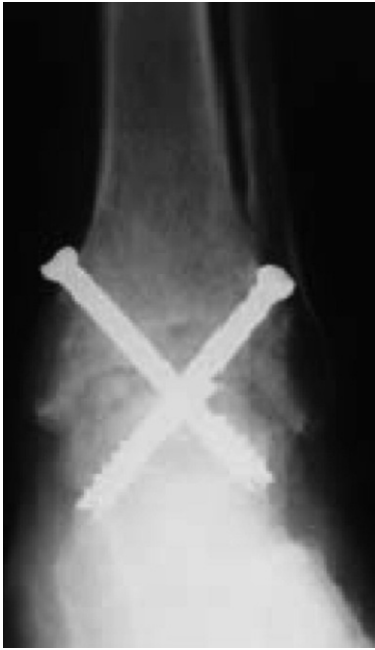
FIGURE 7 Anterior-posterior ankle weightbearing x-ray, 3 months post operative film.